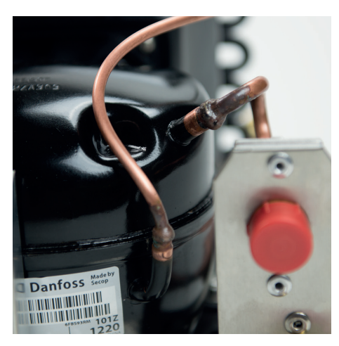
3.COOLING PERFORMANCE Compressor provides 25% more cooling performance