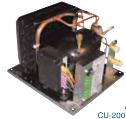
Adler/Barbour CU-200 ColdMachine