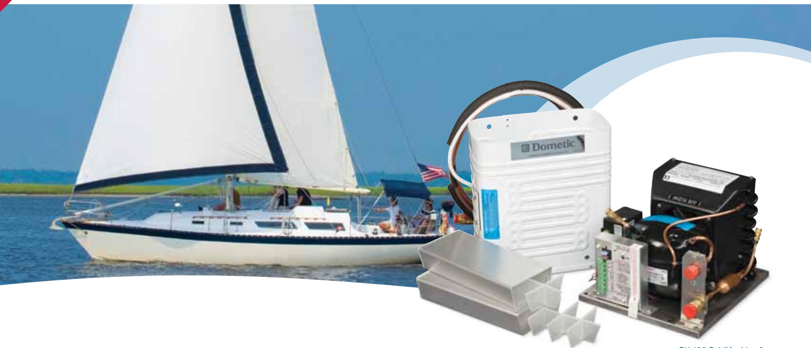
CU-100 ColdMachine & VD-150 Evaporating Unit (shown with ice trays)

Performance, efficiency, and quality are hallmarks of Adler/Barbour ColdMachine Kits by Dometic. Two configurations are offered: The air-cooled CU-100 ColdMachine, and the air- and water-cooled CU-200 SuperColdMachine. Powered by a Danfoss BD50F compressor, these easy-to-install units provide up to 15 cu. ft. (424 liters) of refrigeration and work with a variety of 100-Series evaporators (see reverse side).