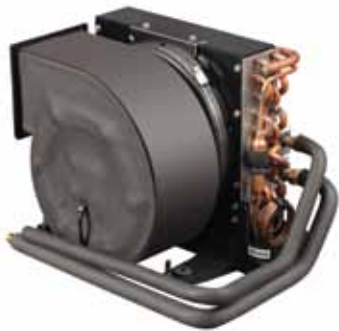
Emerald 12K unit shown with optional lineset extensions.